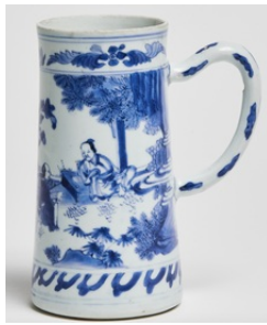
A blue and white porcelain crucible with handle, so-called "Quick". China, Transitional Period (1635-1644). Height: 18.5 cm | Diameter: 10 cm. Typical example of Chine de Commande or export porcelain commissioned by the Dutch East India Company