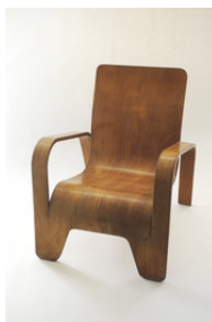
BOW chair Grete Jalk, 1963 Print run: 200 copies WonderWood

Linking up with Amsterdam 750 Years, one of PAN 2024's themes, Vandervren Oriental Art is bringing a collection of Chinese blue/white export porcelain. In the 17th and 18th centuries, Amsterdam was for a long time consecutively the largest trading centre for Chinese porcelain in Europe. Vandervren's collection fits into this historical context. The porcelain was ordered by VOC merchants and served as a commodity.