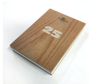
Jubilee edition WonderWood Two editions