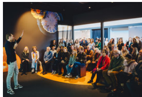
PAN Podium