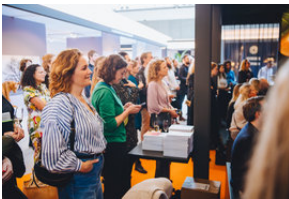
PAN Podium

In cooperation with partners such as Stichting Amsterdam 750, Amsterdam Museum, Codart, VNK and others, PAN Podium has an inspiring programme to offer again this year. The themes in lectures and panels are different every day. They range from the history of Amsterdam to the surprising role of colour, and from developments in technical research to the need to travel for the sake of art. Those who visit PAN Amsterdam are welcome to all parts of this programme.