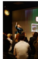
PAN Podium