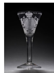
D'Goede Regering Van Amsterdam Lead glass, 18th century, Frides Laméris Kunst- en Antiekhandel Spaeker 25 November