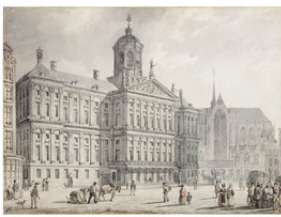
Cornelis Springer Paleis op de Dam