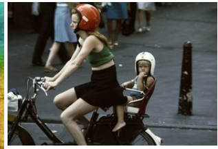
Woman and child on moped Ed van der Elsken, 1973-1975 'Amsterdam' 'Al die Amsterdamse mensen' Speaker 25 November