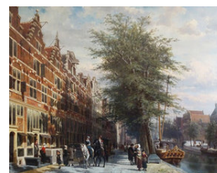
Cornelis Springer Gezicht op de Herengracht E.J. van Wisselingh & Co