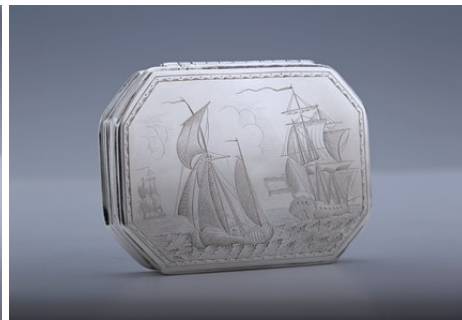
Tobaccobox with ships Amsterdam ca 1740 Hendrina Das