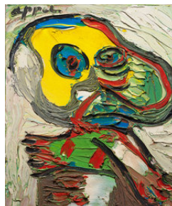
Karel Appel Personnage 1976 Oil-Canvas