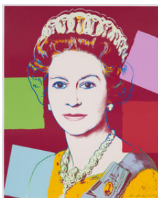
Andy Warhol Reigning Queens Elizabeth II of England