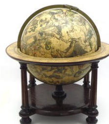
Valk hemelglobe, 1715